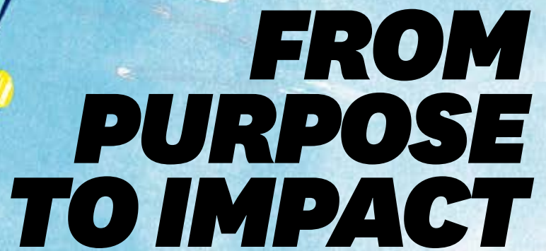
Figure out your passion and put it to work.